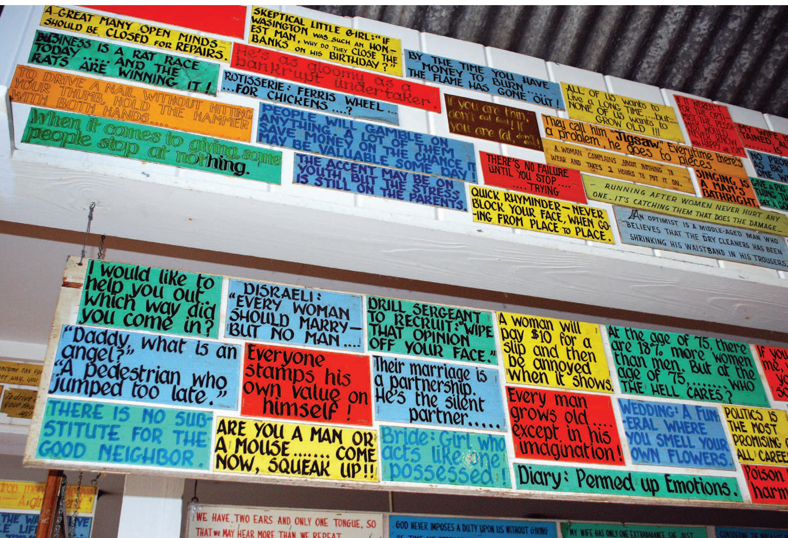
Messages of wit and wisdom cover the walls of the original Wintzell's Oyster House. Founded in 1938 by Oliver Wintzell at 605 Dauphin Street, it is a perennial Mobile favorite for locals and tourists alike.