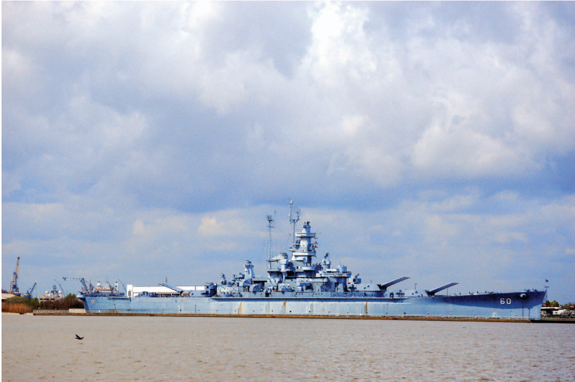
Battleship Memorial Park features the World War II-era battleship USS Alabama.