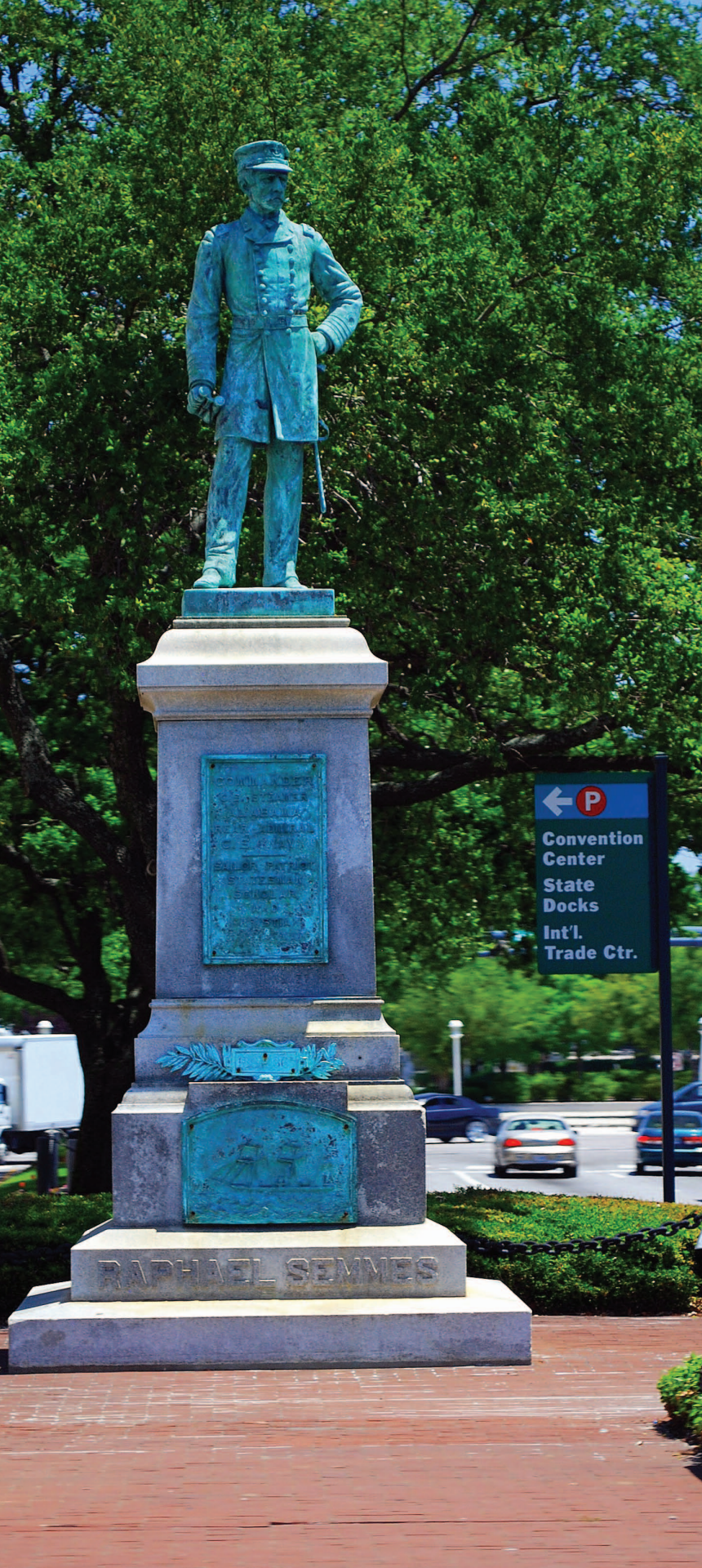
Raphael Semmes was the famed captain of the Confederate cruiser CSS Alabama. His statue, on Government Street, is engraved with "Sailor, Patriot, Statesman and Scholar."