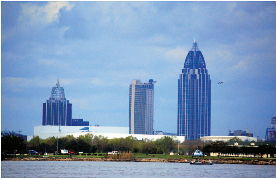
Mobile's waterfront skyline is dominated by the thirty-five-story RSA Battlehouse Tower and RSA Bank Trust Building.